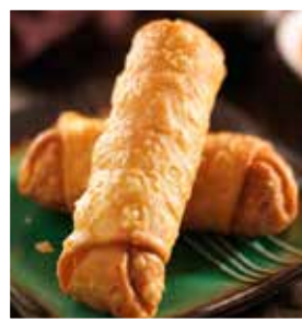
MINH Pork & Vegetable Egg Rolls #4095....$14.99