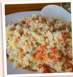
MINH Vegetable Fried Rice #7367....$12.99