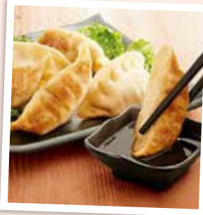
Ling Ling All Natural Chicken and Vegetable Potstickers #4767....$19.99