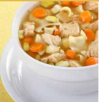
CHICKEN NOODLE SOUP

From soup to stroganoff, a case of Seasoned Diced Chicken Breast Pieces makes a wide variety of great meals.