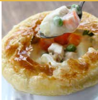
CHICKEN POT PIE